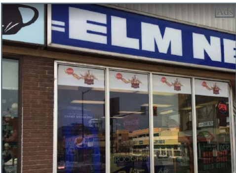
Elm News 59 Elm St, Greater Sudbury, ON P3C 1R6