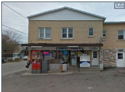
Melvin's Variety Store 400 Melvin Ave, Sudbury, ON P3C 2R5