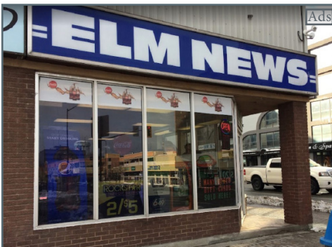
Elm News 59 Elm St, Greater Sudbury, ON P3C 1R6