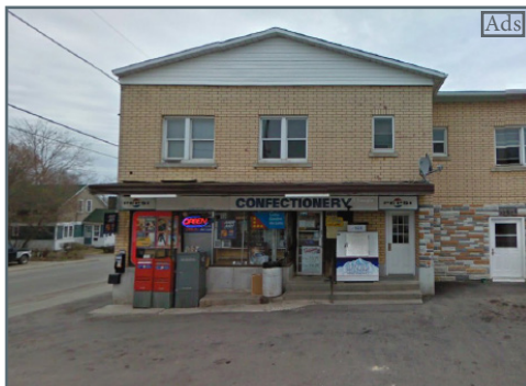
Melvin's Variety Store 400 Melvin Ave, Sudbury, ON P3C 2R5